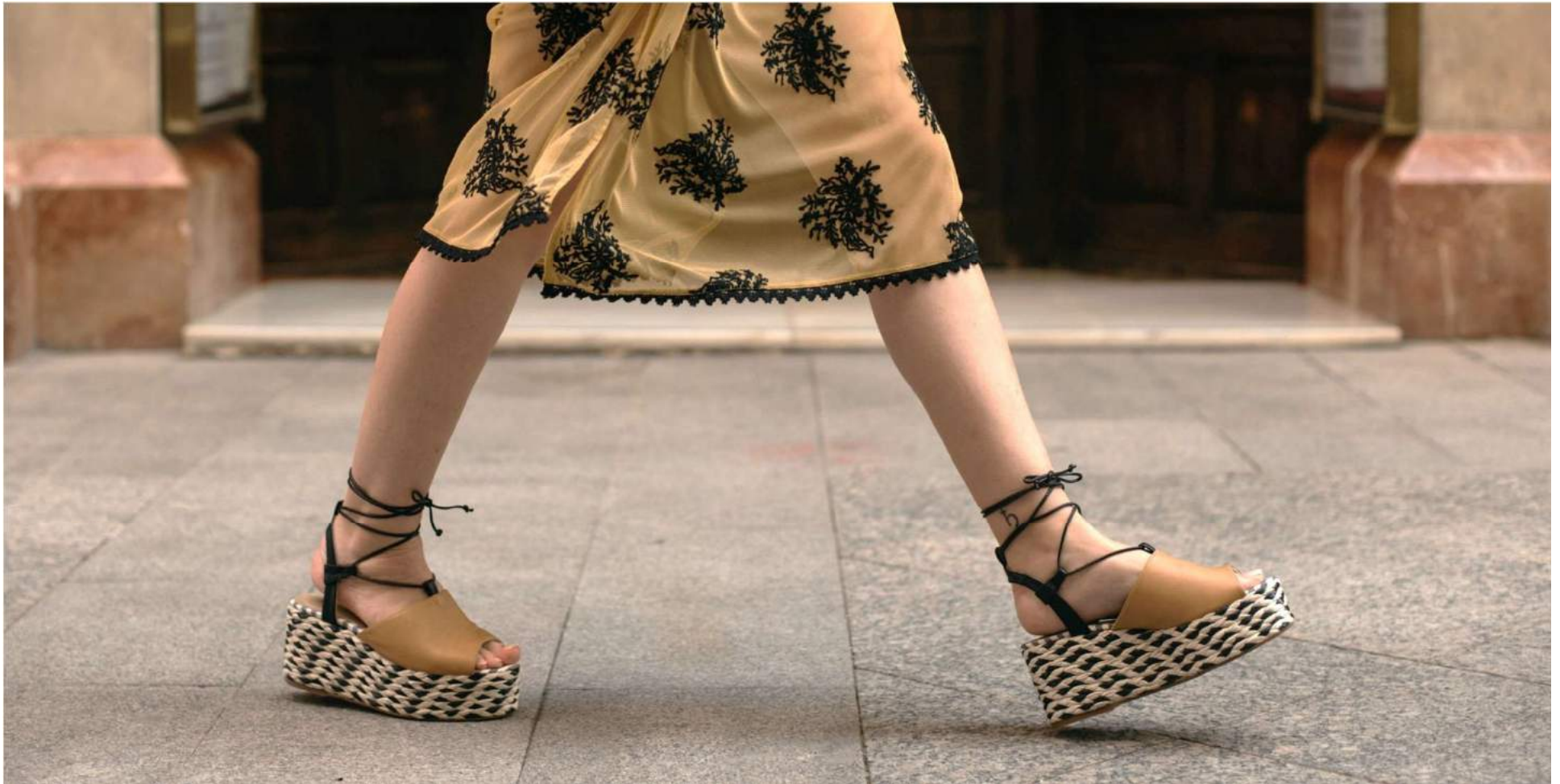
Bicolor Rafia Platforms